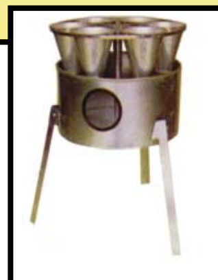
Killing cone funnel